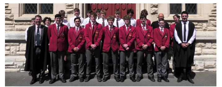
ACHIEVEMENT IN NCEA (PARTICIPATION BASED DATA) -WAITAKI BOYS' HIGH SCHOOL

In 2023 we were pleased to see our pass rates across all levels of NCEA significantly above the national boys average and of those schools with a similar equity index.